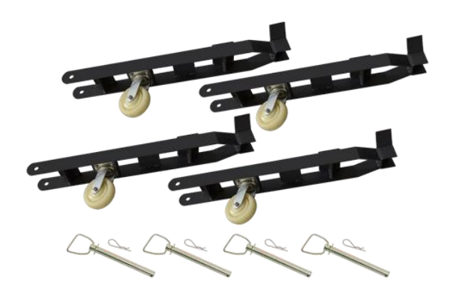
Removeable Wheel castors