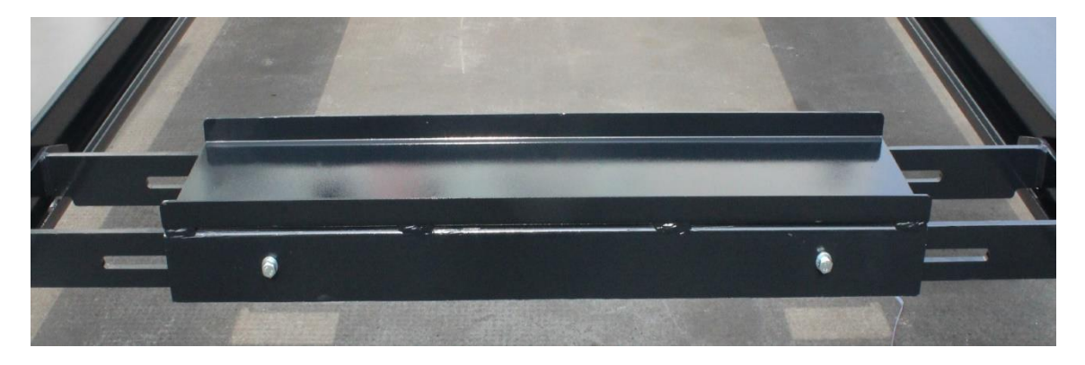
Sliding tray to hold trailer jack leg, expands according to the placement of the runways