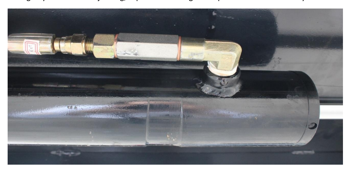
Hydraulic cylinder under the runway has explosion-proof valve