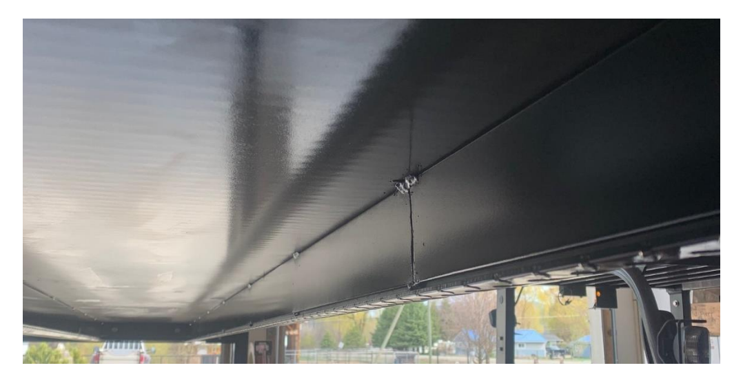
Welded on steel doubling on the underside of the ramps for extra strength