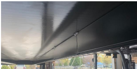
Welded on Steel doubling for extra strength