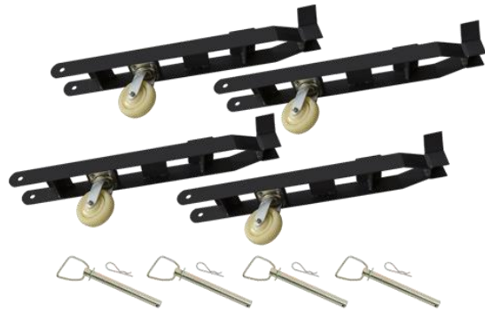
Wheel Castor kit