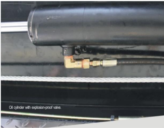
Cylinder with explosion-proof valve