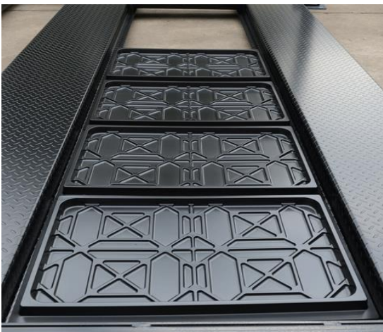
Drip Trays x 4