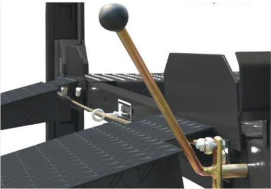
Heavy Duty Release Mechanism and Runway stoppers